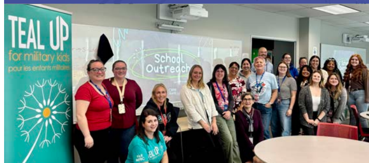
Our School Outreach Team was invited to present to SchoolsPlus staff during their training day.