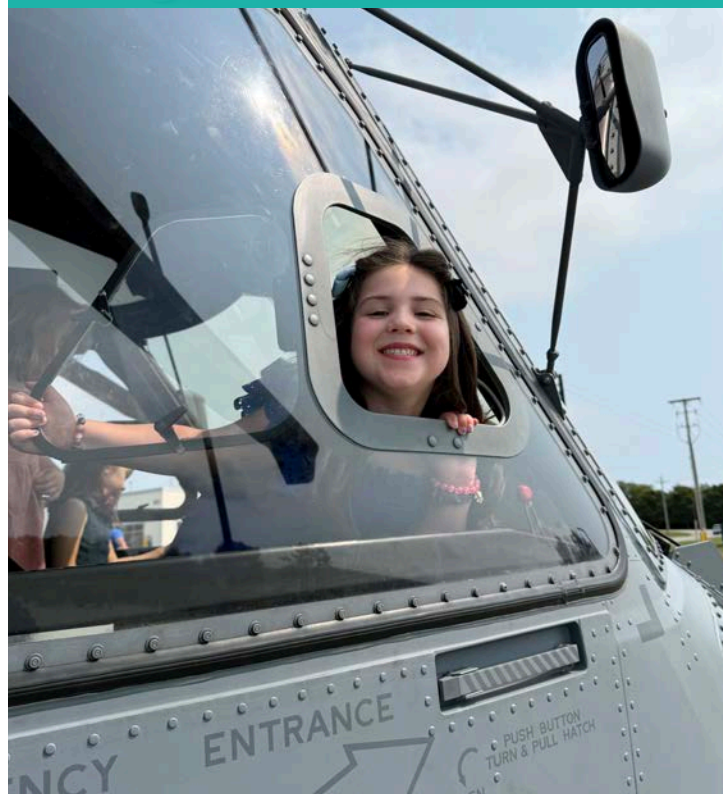
Community members of all ages love exploring the Cyclone Helicopter at Bluenose Bienvenue!