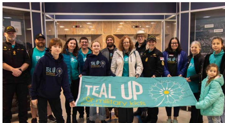
We took a group photo inside with the flag before it was raised on a very rainy day at CFB Halifax.

Efforts are underway to advance our work in assessing the needs of military families living outside HRM. We aim to identify the military family footprint in communities within our geographical area, including Cape Breton and learn more about their demographics, challenges, and current supports.