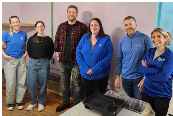
RBC staff volunteered with us this fall, painting an area of our Henderson Sweetman Youth Centre.