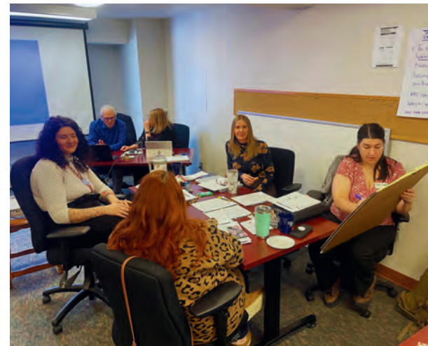
Strategic Planning, March 2023

We value our stakeholders and clients' feedback and use it to improve our service delivery. While our post-activity feedback is ongoing, we concluded our strategic planning activities last year. The contributions of time and expertise from our board and staff were truly remarkable. Our strategic plan will serve as our guide in the years ahead. Should you require a copy of the plan, please request it by emailing allison.payne@winnipegmfr.ca .