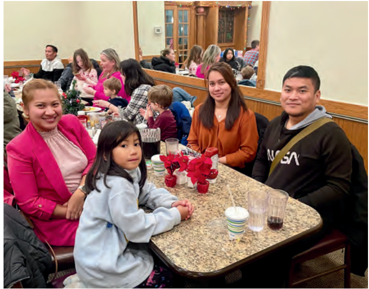
The Tolentino family at the Turkey Deployment Dinner November 2023

We offer individualized and group-based support to members and their families who are dealing with the challenges of absences or separations due to deployment or training.