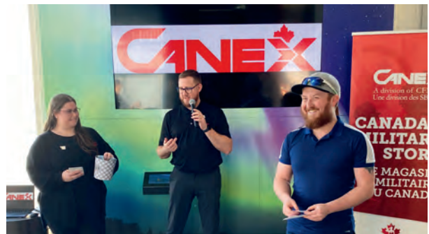
17 Wing Volunteer Appreciation, March 2024

We also engaged with our community partners/service providers, including: