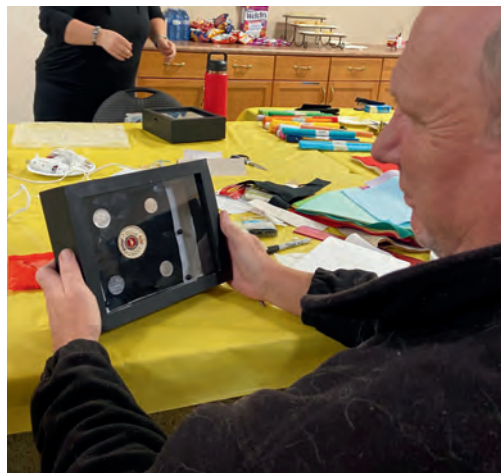
One of our veteran attendees of Shadow Box Art Therapy

"All the little things came together to produce an excellent program; 10 out of 10!" -- a veteran