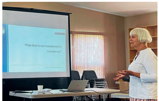
Restorative Justice Training, August 2023

Through the Helping Professionals Committee, we were able to organize the Restorative Justice Training for 17 Wing personnel and our staff in August 2023. This workshop, provided by the Crisis and Trauma Resource Institute (CTRI) , offered insights on integrating restorative justice principles when addressing harmful situations.