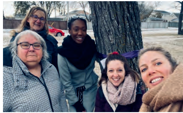
Ribbon Ceremony, November 2023

Apart from organizing and attending GBV training, we also take part in 17 Wing-initiated events addressing GBV. These included the 16 Days of Activism Against Gender-based Violence observed in November 2023, where we displayed a purple ribbon during the ribbon ceremony to symbolize our commitment to raising awareness and helping end GBV.