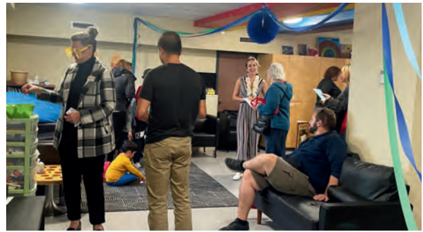
MFRC Open House, October 2023

"We learned about several things that the MFRC offers that we were previously unaware of. Meeting all the staff makes future visits to the MFRC less intimidating." - an Open House attendee