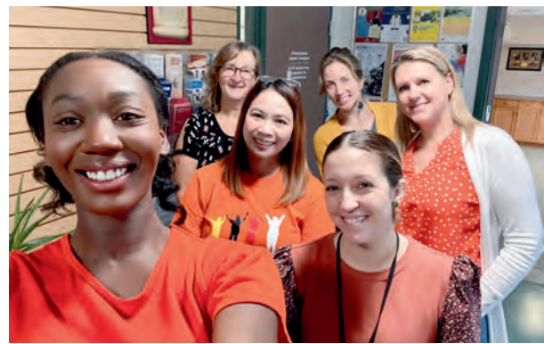
National Day for Truth and Reconciliation September 2023

In addition to our continued training on culture and diversity, we engaged in various celebrations and awareness campaigns within and outside the military community.