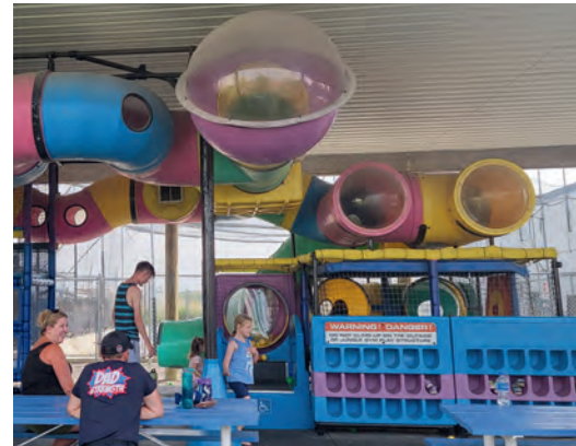
Family Fun Day at Thunder Rapids Amusement Park

“We had time together as a family during a very stressful time where we don’t know anyone in the new place, don’t know fun things around. It was very helpful and it is always nice to meet new people.” -- a relocated family