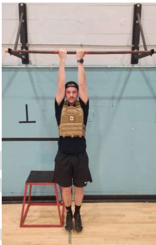
B) Dead hang