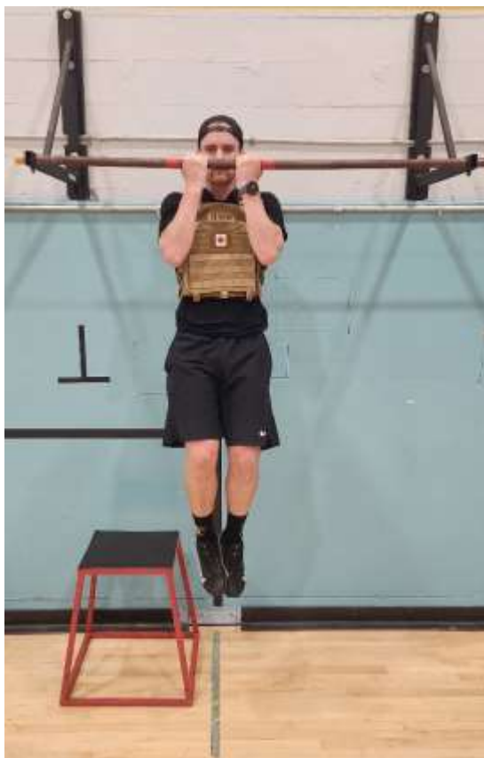
A) Flexed arms hang