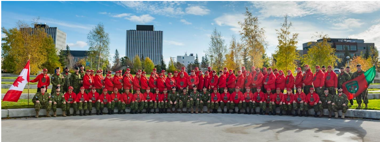
Canadian Rangers in Yellowknife, NT during Leadership Training in October 2019

The role played by the CRs and staff of 1 CRPG is vital to providing a Canadian Armed Forces (CAF) presence in the North. Our motto “Vigilans” when translated means “The Watchers”