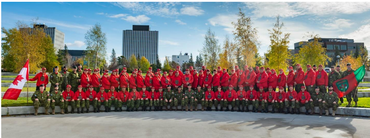
Canadian Rangers in Yellowknife, NT during Leadership Training in October 2019

The role played by the CRs and staff of 1 CRPG is vital to providing a Canadian Armed Forces (CAF) presence in the North. Our motto "Vigilans" when translated means "The Watchers"