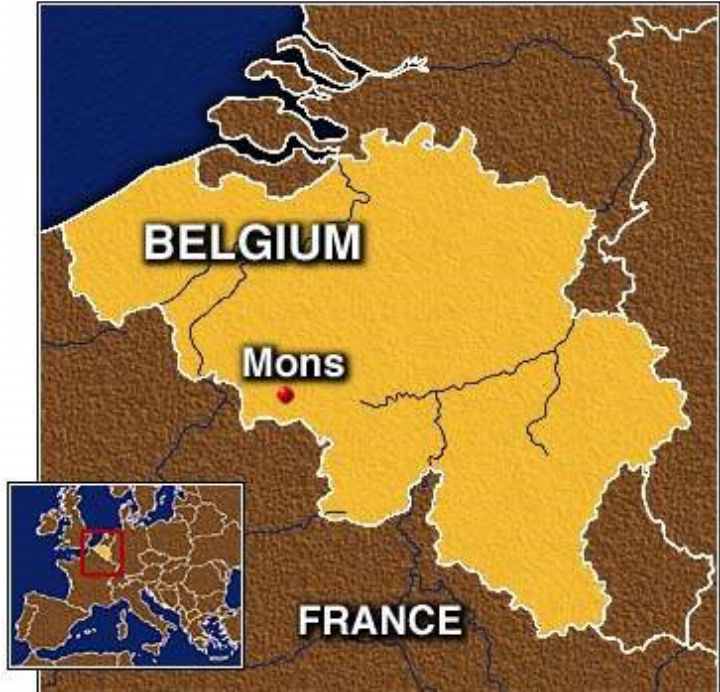
MAP OF BELGIUM (WITH MONS)