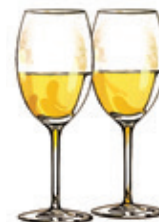
Glasses of cider 140 ml/5 oz 6% alc./vol.