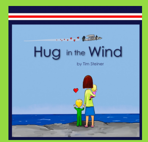
Hug in the Wind