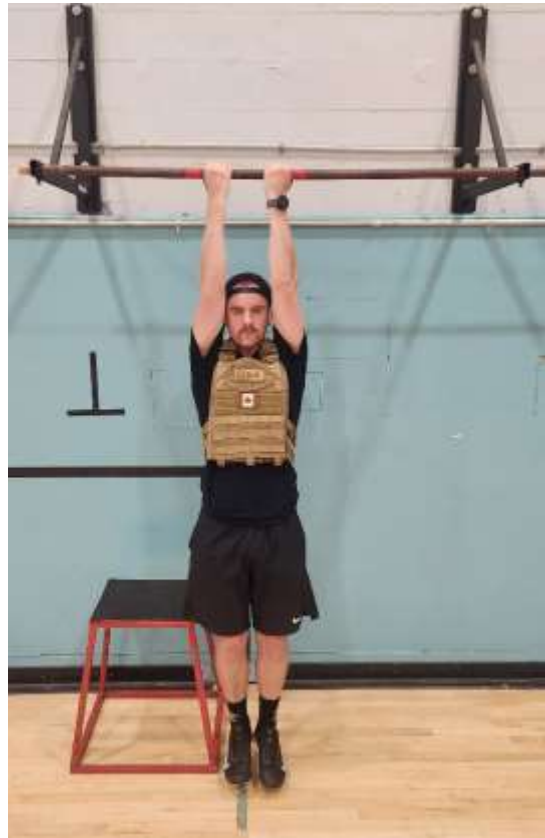
B) Dead hang