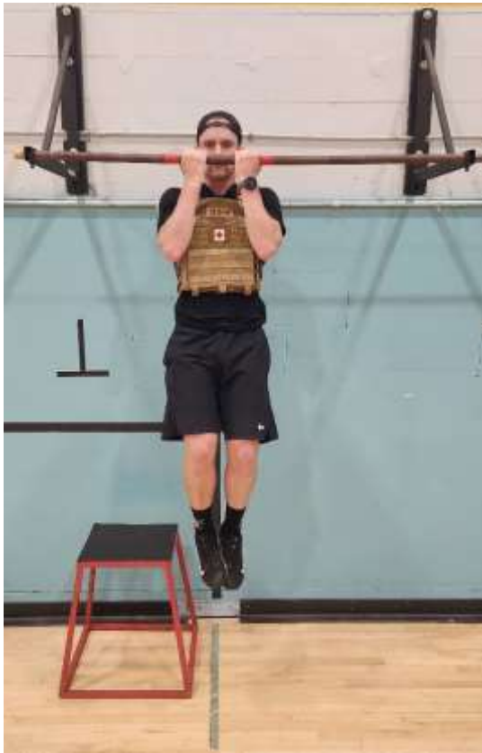
A) Flexed arms hang