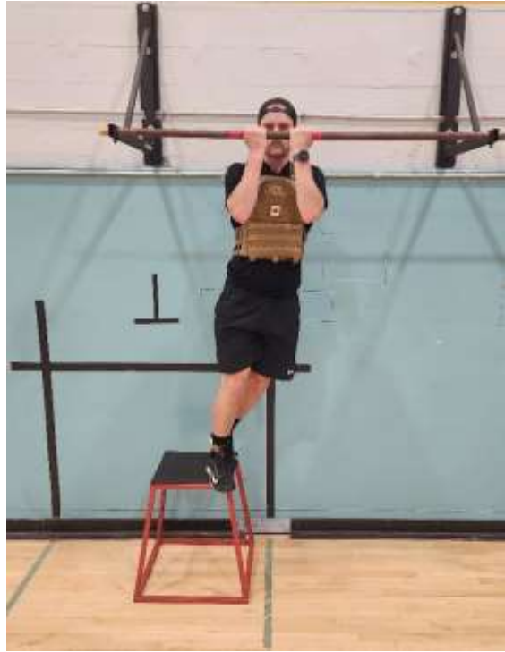
Figure 4.1 Appropriate set-up/starting positions